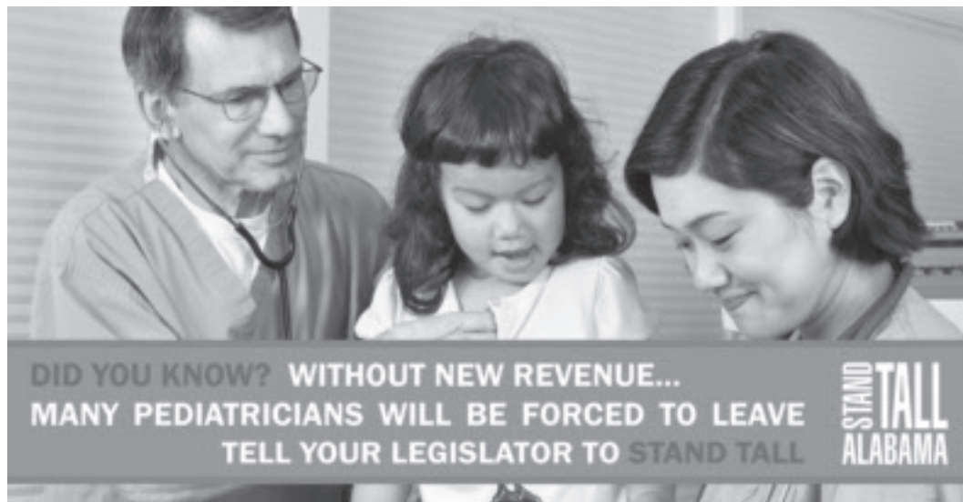
An example of a social media message from the Stand Tall Campaign

As of September 10, the Governor's proposed revenue bills are moving through committee in the House; if passed, these measures would fully fund Medicaid at its current level for 2016. Fingers crossed!